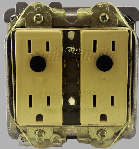
DCP-2PD 2 Gang GFCI/Decora Receptacle Cover w/pins

Simply push the rivets into the ground lugs - the cover is now securely set for safe transport and onsite job conditions. Made with translucent yellow PVC, these covers are strong, durable and completely router proof. Available in up to 6 gang.